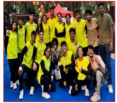
Debut at @iitbombay – Top 3 in Beat theStreet! 🏆 (26 Dec '24)