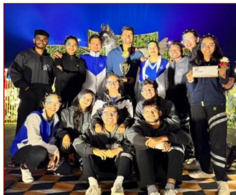
2 nd Runner up at @niempune 12 nov 2024