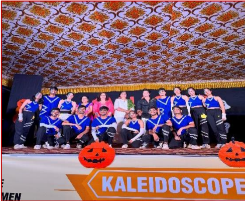
Winners At @ kaleidoscope_24 oct 2024